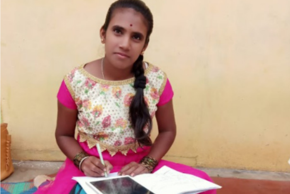
IMAGE Staff also counselled her to complete her studies. She realised the importance of education and was happy to pursue her dream of getting educated. She got herself enrolled for the SSLC exam and started preparing for the same.

When the government imposed nationwide lockdown due to COVID-19, she started to worry about the SSLC exam preparation as the schools were shut and she didn't have access to the study material.