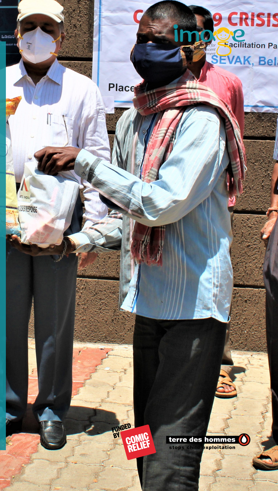
IMAGE Movement members were also asked to be vigilant in reporting possible cases of child marriage which were on the rise during the lockdown. With the help of the girls, many marriages were also stopped .

With the lockdown, the early married girls who have worked hard to resume their education were at extreme risk of dropping out of school. To ensure this doesn't happen the project provided them with access to digital education by distributing E-tablets to girls with preloaded syllabus. Families were also provided with income generation activities to ensure economic support during the crisis.